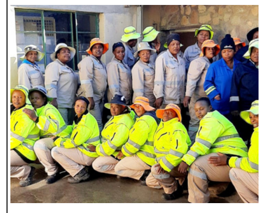
YOU DON'T HAVE TO PLAY MASCULINE TO BE A STRONG WOMAN.