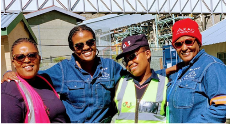
"Its not easy to be a Pioneer-But oh it's fascinating " Elizabeth Blackwell

"Being a woman is worth more than the world actually acknowledges. In your uniqueness, be proud to be a woman; compassionate, fearless, courageous and strong at heart; you are indeed a force to be reckoned with.