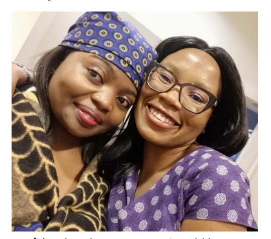
"I just love bossy women. I could be around them all day. To me, bossy is not a pejorative term at all. It means somebody's passionate and engaged and ambitious and doesn't mind learning."