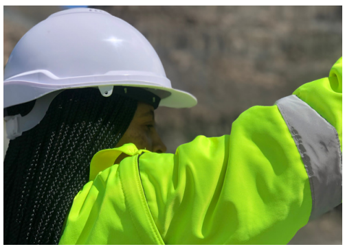
"When we embrace equity, we embrace diversity, and we embrace inclusion."